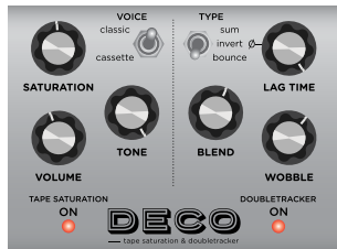
ON THE EDGE