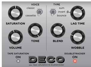
WET SLAPBACK CASSETTE