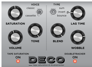
WORN OUT DECK