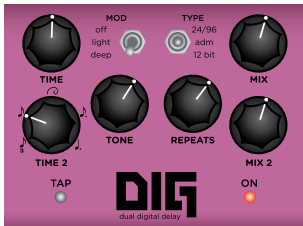
DOWN FROM THE HILLS