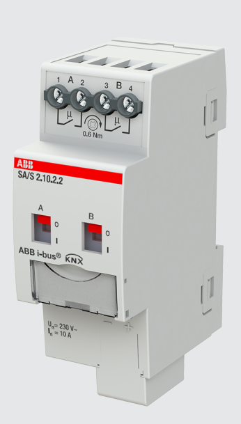
ABB i-bus® KNX SA/S 2.10.2.2 Switch Actuator